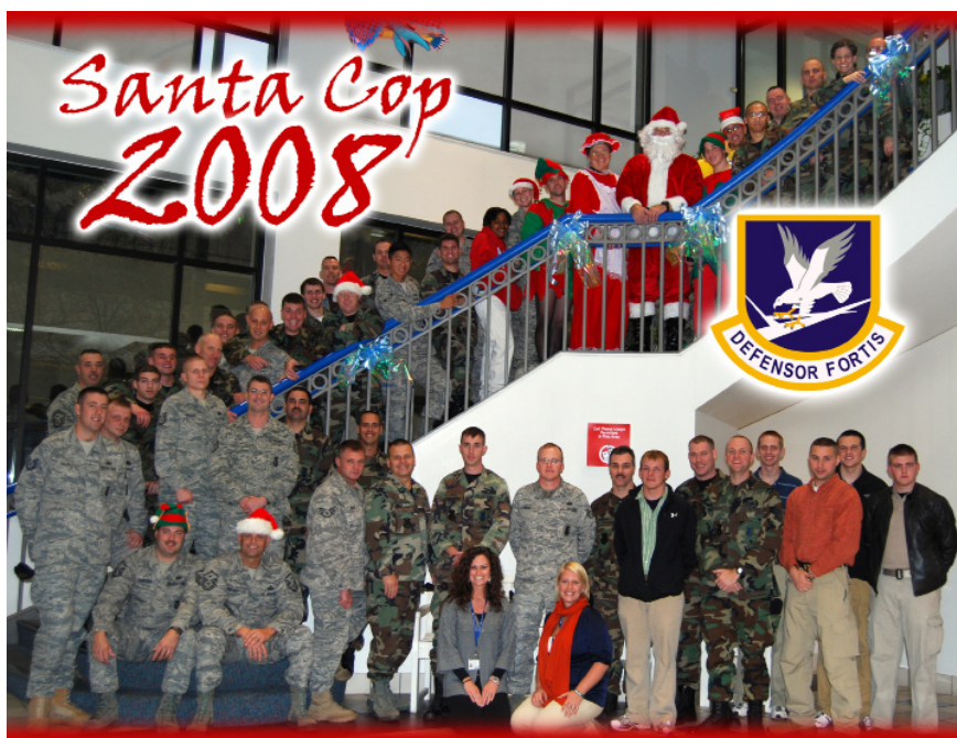
Members of the 134 SFS along with Santa and Mrs. Claus, Spongebob Squarepants, and the elves take a moment for a group snapshot after spending the majority of the afternoon with the children at East Tennessee Children's Hospital distributing gifts on December 6th.