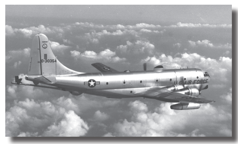
A vintage KC-97 refueling aircraft from McGhee Tyson ANGB flies through the clouds on the way to it's next mission.

"After further review, there is enough evidence to overturn the ruling on the field". At this time of year, you hear those words a lot if you watch enough football. The Maintenance Group was very excited to hear similar words concerning the recent LCAP Inspection. The initial grade that was given to