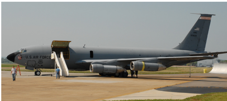
An E-Model Tanker sits on the ramp during one of the past Family Day events at McGhee Tyson ANGB. The E-Model engines were replaced by the larger and more efficient R-Model engines.

day not only for Air Mobility Command, which operates our nation's fleet of aerial refueling aircraft, but also for our country as this is a capability we critically need," he said. "As a warfighter, I'm glad to see this day come."