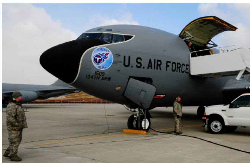
Aircraft maintainers do final checks on a KC135-R as part of their preparation for an upcoming orientation flight on February 25th.