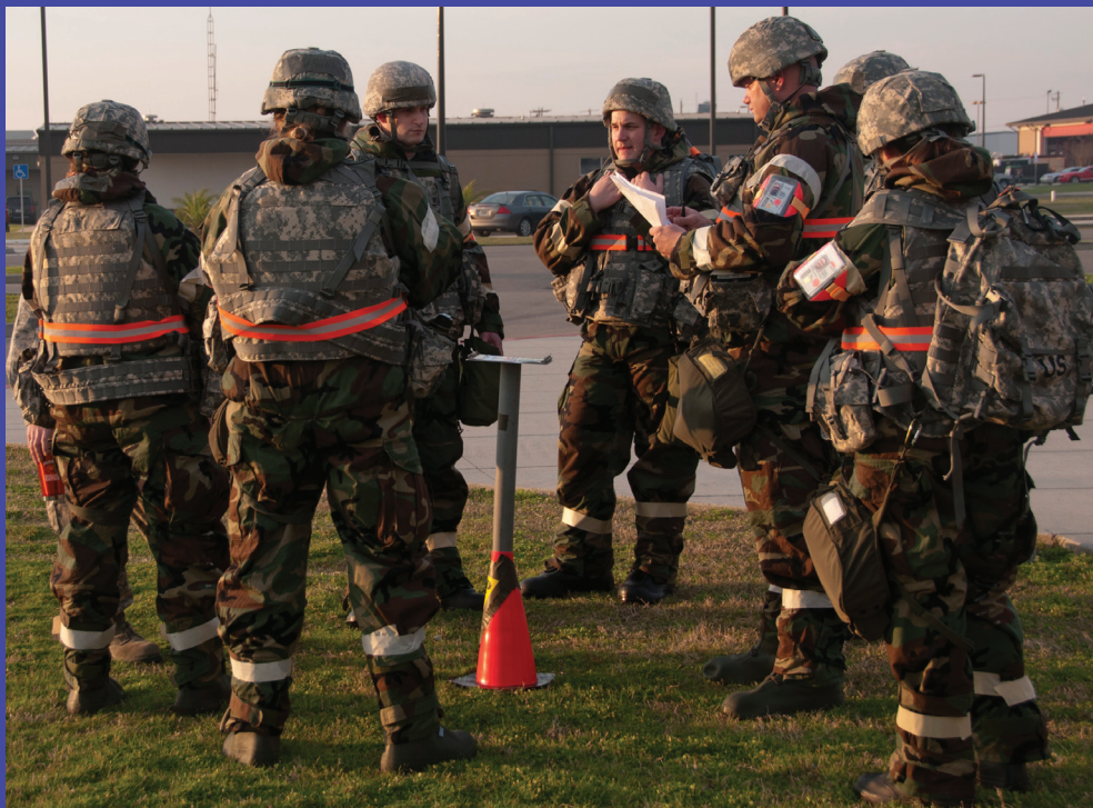
Members of the 134 ARW train on Post Attack Reconnaissance during an Operational Readiness Exercise at the Combat Readiness Training Center in Gulfport, Miss. Feb 8-12.

As we prepare for the ORE/ORI battlefield scenario, each member faces a unique job to obtain all equipment, set up required unit control centers, and begin operations to establish mission operations. Members must also take on additional roles, which are equally important to maintaining operational safety and security, to the overall flow of the daily mission. Facility managers, and post attack reconnaissance (PAR) teams are just a couple.