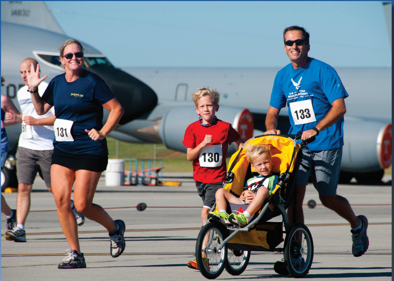
Members of the 134th Air Refueling Wing participate in the 1st Annual Family Day 5K Run. The run was established as a way to build camaraderie within the wing and also to raise money for the Annual Santa Cops Event to buy toys and gifts for the children at East Tennessee Children's Hospital.