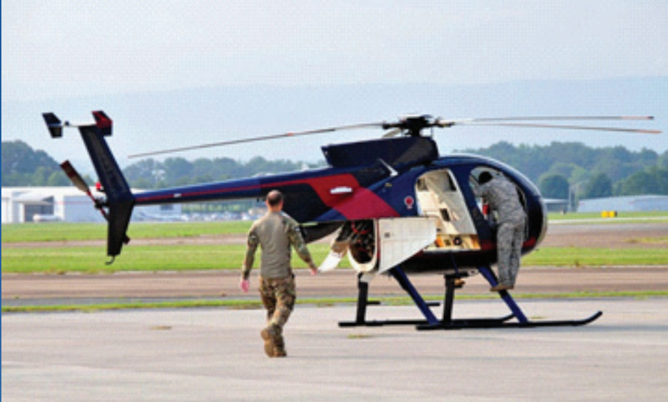
A DEA special agent and an Army National Guard pilot conduct pre-flight checks on an aircraft at McGhee Tyson Air National Guard Base, TN as part of the DEA aviation division's ERAD program.

The Tennessee National Guard recently teamed up with the U.S. Department of Justice Drug Enforcement Administration (DEA) Aviation Division's Mobile Cannabis Eradication Response Team (M-CERT) in support of an annual Cannabis (marijuana) eradication program better known as "ERAD".