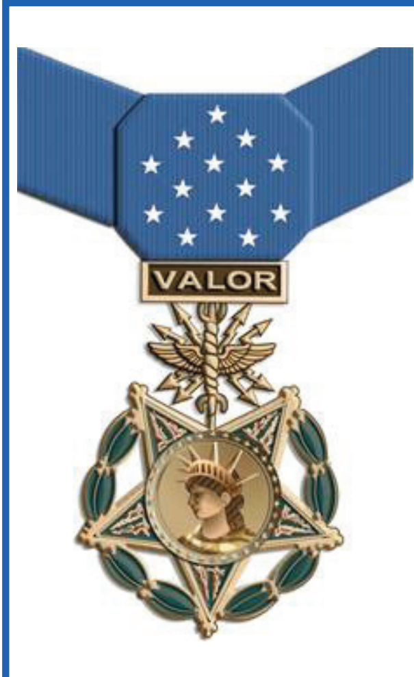
Medal of Honor. The Medal of Honor is the highest award for valor in action against an enemy force which can be bestowed upon an individual serving in the Armed Services of the United States. Although it was originally created for the Civil War, Congress made the Medal of Honor a permanent decoration in 1863. The current Air Force version was approved in 1965.

These are only a small sampling of the many bridges, highways, and other landmarks for Medal of Honor recipients from East Tennessee. A few others of note include the Edward R. Talley Bridge over the Clinch River on State Route 70 in Hancock County; the Milo Lemert Memorial Bridge in Savannah, TN; and the Kinser Bridge in Greene County.