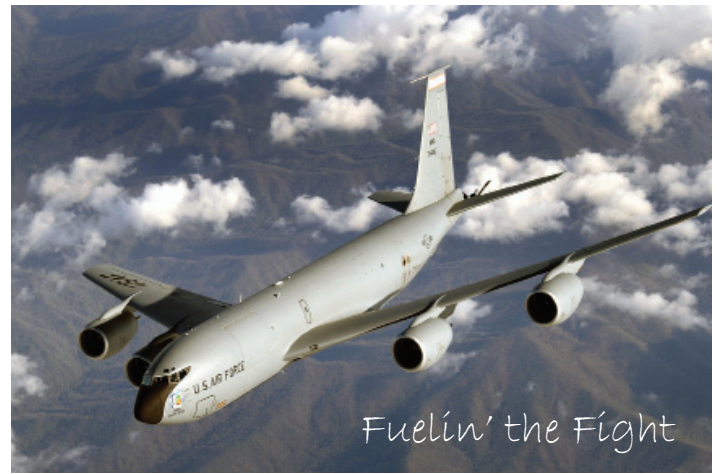
Fuelin' the Fight

All E-1s through E-6s are encouraged to attend. The JEAA meeting will be in the FSS breakroom room on Saturday at 1400. Hope to see you all there!