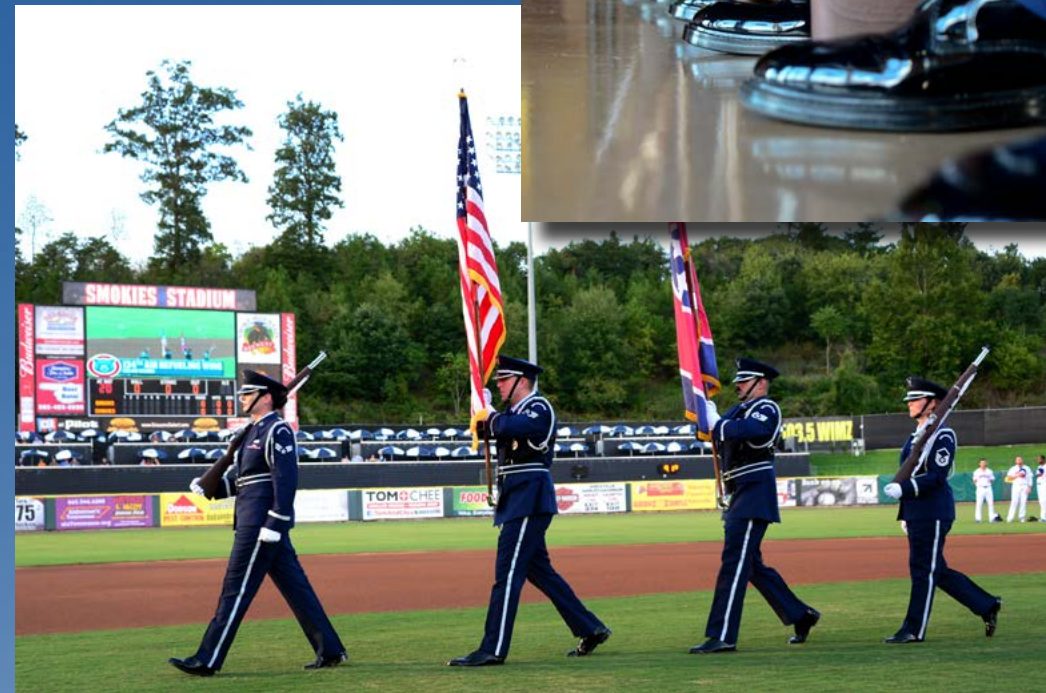
A member of the McGhee Tyson Honor Guard Team (above) perfects and polishes his belt prior to an event Aug. 31, 2016. Members of the Honor Guard Team (above, right) practice their drills in polished and pressed dress uniforms during a practice session prior to the Smokies Stadium event. Members of the McGhee Tyson Honor Guard Team (left) present the colors at the Smokies Stadium Aug. 31, 2016.