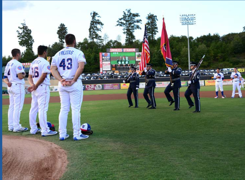
Members of the McGhee Tyson Honor Guard Team (above) march out onto the field prior to the baseball game at the Smokies Stadium in Kodak, TN Aug. 31, 2016. Members of the Honor Guard Team (right) help prepare and perfect each others uniforms during a training session for an upcoming event.