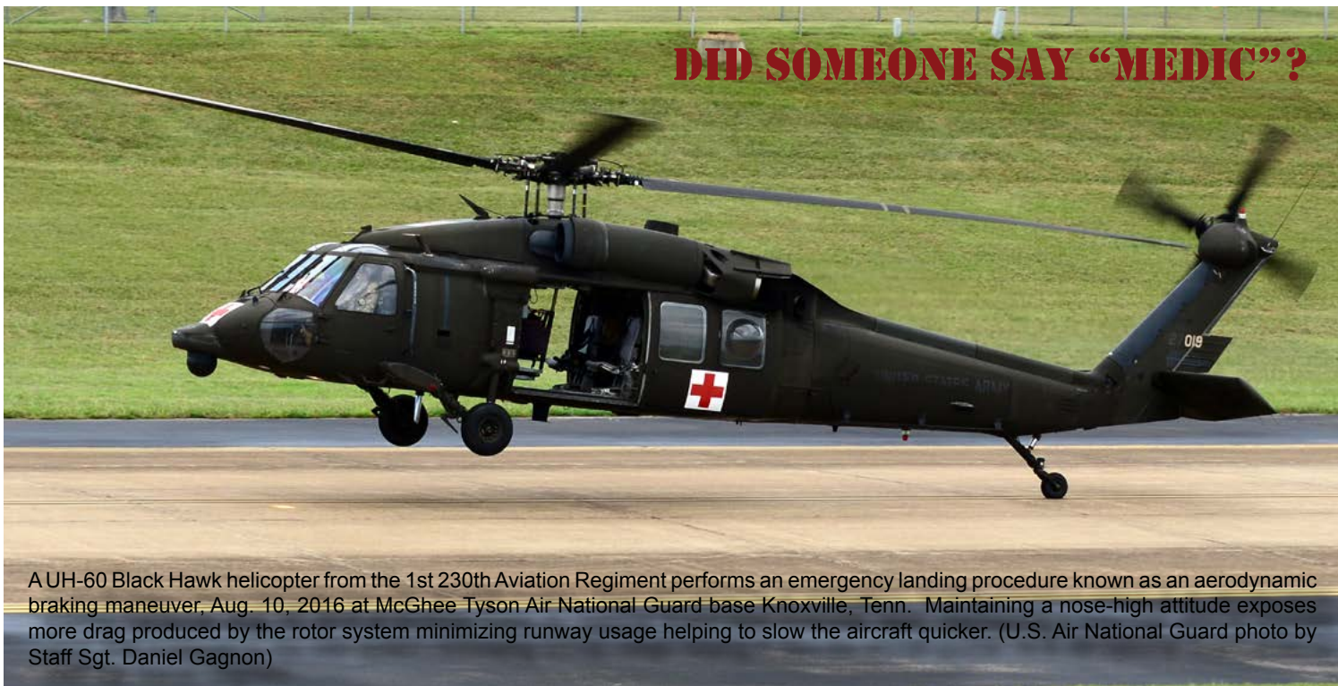
A UH-60 Black Hawk helicopter from the 1st 230th Aviation Regiment performs an emergency landing procedure known as an aerodynamic braking maneuver, Aug. 10, 2016 at McGhee Tyson Air National Guard base Knoxville, Tenn. Maintaining a nose-high attitude exposes more drag produced by the rotor system minimizing runway usage helping to slow the aircraft quicker.