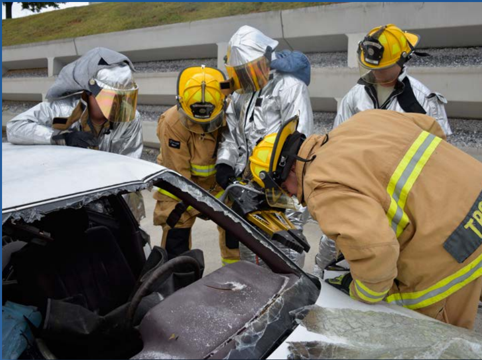
Members of the 134th Air Refueling Wing Fire Department and Medical Group train together on how to extricate a victim from a car during a mock vehicle accident.

This is the first joint training to take place between the fire department and clinic personnel on auto extrication, emergency treatment procedures, and safety procedures for an accident scene.