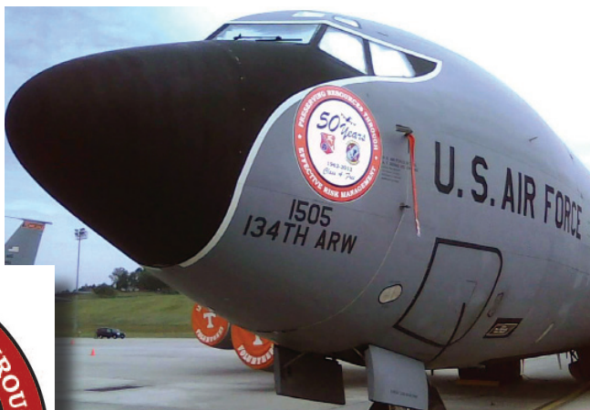
The newly applied nose art reflecting 50 years of Class A-free mishaps dons the nose of a KC-135R on the ramp at McGhee Tyson ANG Base.

is also true that to continue maintaining this record beyond 50 years will be even harder than before,